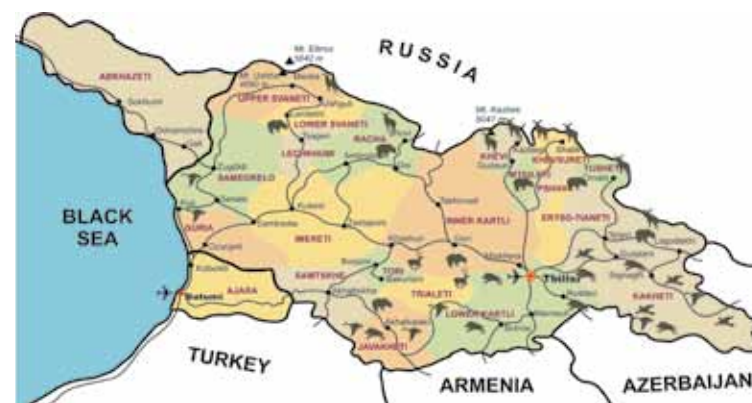
Nearly 40% of Georgia's territory is still forested and a large proportion is untouched by human hands. Over 40 protected areas, (where hunting is banned) are making strong contribution in Georgia's wildlife preservation.

Caucasus Safari enjoys strong partnerships with local hunting farms. They usually offer hunting of wild boar, roe deer, hares, marten, pheasants, rock partridge, ducks, etc. As all those species can be hunted in farms as well as on free territories. We are choosing areas and design programs based on season, particular conditions, logistics and etc.