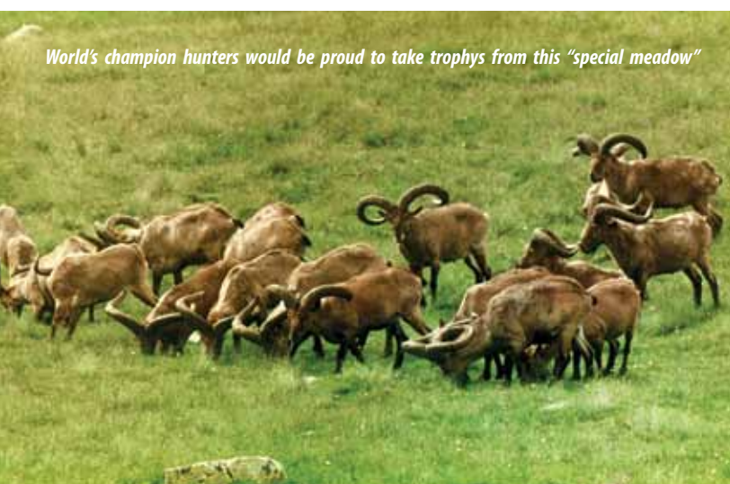
World's champion hunters would be proud to take trophies from this "special meadow"