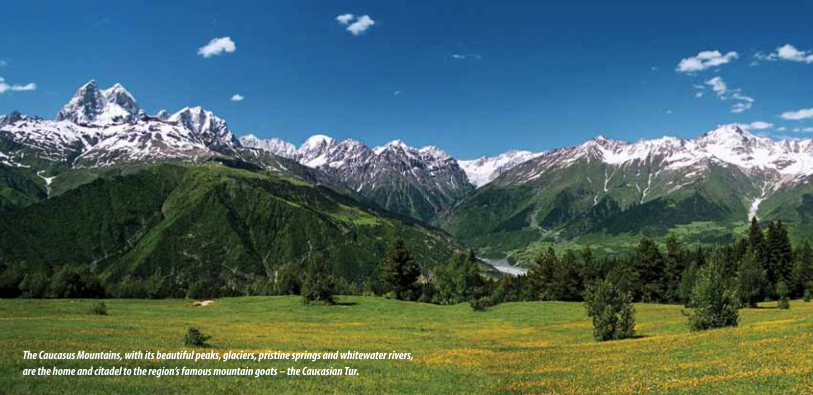
The Caucasus Mountains, with its beautiful peaks, glaciers, pristine springs and whitewater rivers, are the home and citadel to the region's famous mountain goats – the Caucasian Tur.