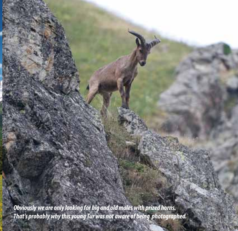
Obviously we are only looking for big and old males with prized horns. That's probably why this young Tur was not aware of being photographed.